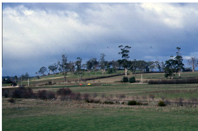
Fig. 2 Tasmanian savanna of scattered eucalyptus trees, surviving among the straight hawthorn hedges and bright green agricultural grassland of an English-type cultural landscape.

Second-hand timber from shipwrecks, or driftwood from the cargoes of timber ships, may go far to substituting for islands' lack of trees. Shipwrecks on small islands could be catastrophic, if human survivors or escaped rats ate up the islanders' provisions.